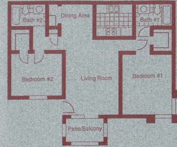
TWO BEDROOM TWO BATH